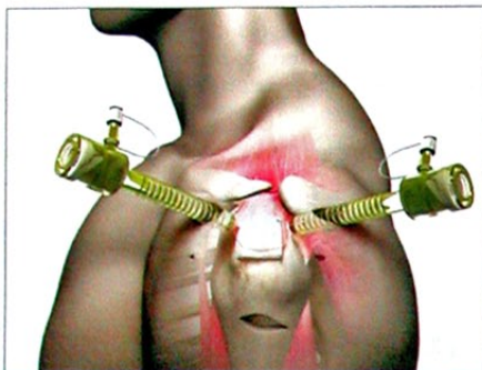
Figure 4. (above) Arthroscopic repair of rotator cuff, using bovine xenograft, 2 in progress.

describes arthroscopic implantation as "such a revolutionary approach to an otherwise unsolvable problem. It is good for irreparable tears on an otherwise good shoulder, without arthritis," he says. "The problem, for whatever reason, is that the rotator cuff has failed and cannot be repaired by standard methods. It is indicated for