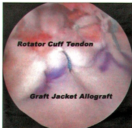
Figure 2. View in surgery of Graft Jacket installed to fill defect in rotator cuff.