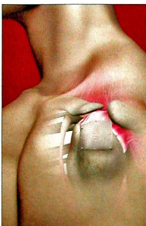
Figure 5. (left) Bovine xenograft 2 in place.

Special stitches are run outside and inside the body, and suture anchors are affixed to the bone. The sutures are run out through the allograft and pulled in to position it. Some additional stitches are made around the allograft's edge.